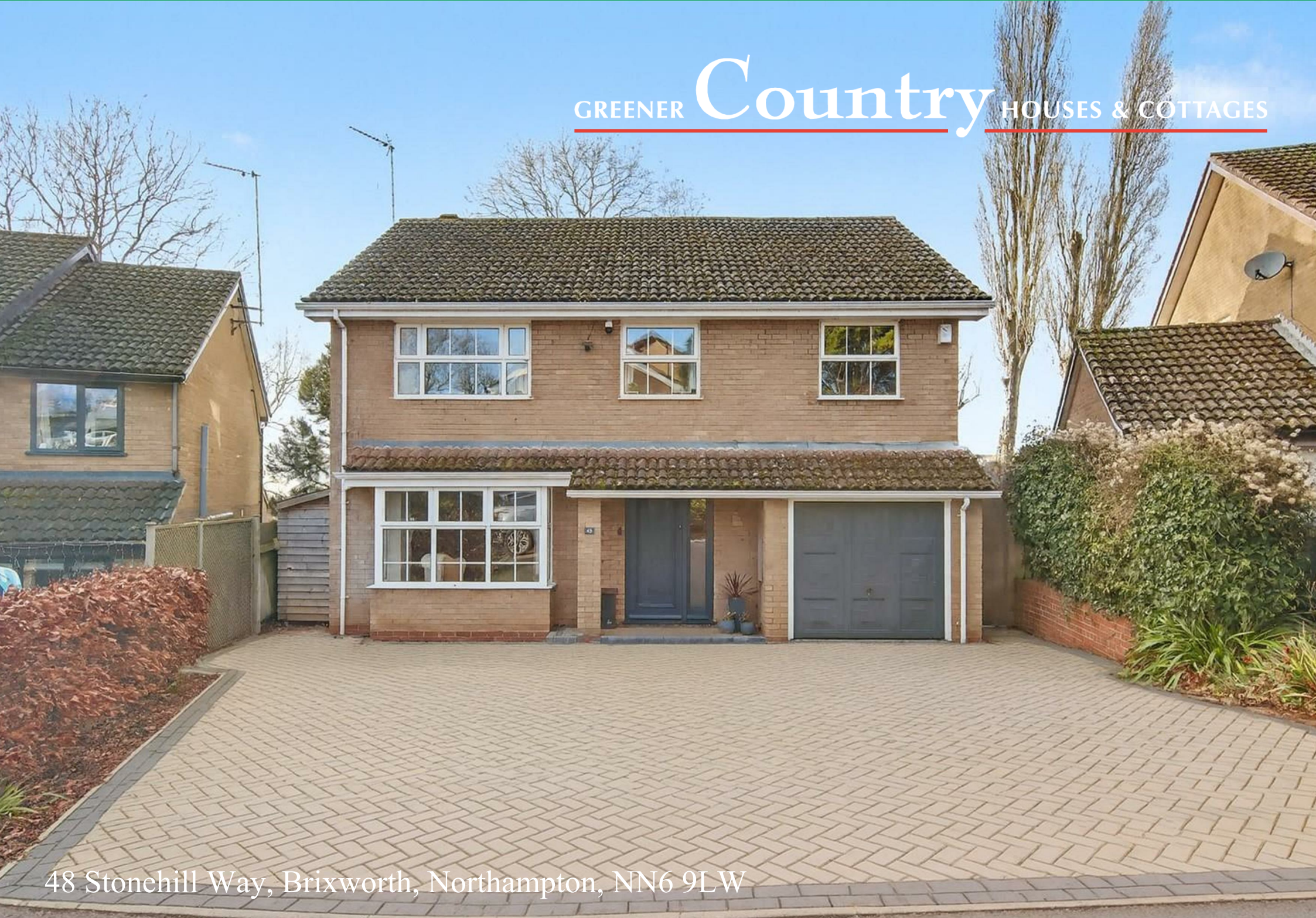
48 Stonehill Way, Brixworth, Northampton, NN6 9LW